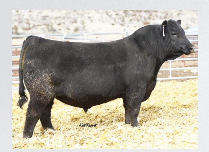
Sire of Lot 6