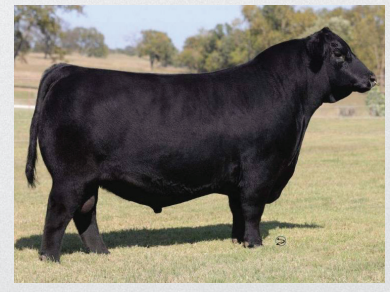
Sire of Embryos